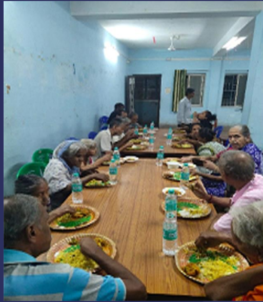
Day Celebration in the campus