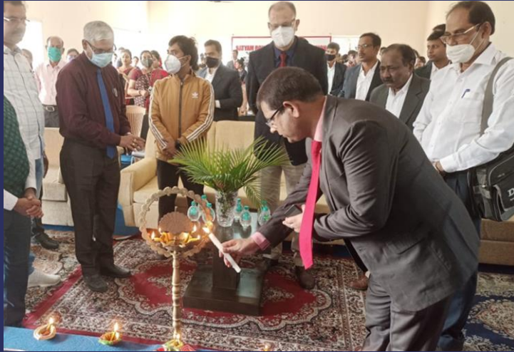
INAUGURATION OF COMMUNITY HEALTH CENTRE AT FALAKATA