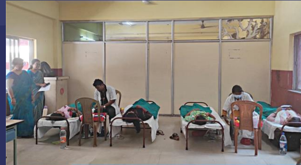
Blood Donation Camp organised by Techno Global Hospital Barrackpur. For parents, teachers and staffs of TIGPS Hooghly.