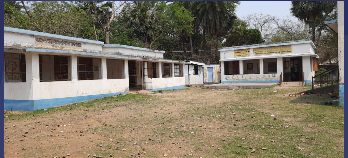
Bondanga Adibasi Primary School