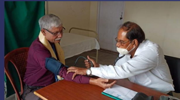
General Health checkup is done on a regular basis along with free medicines distribution for patients.