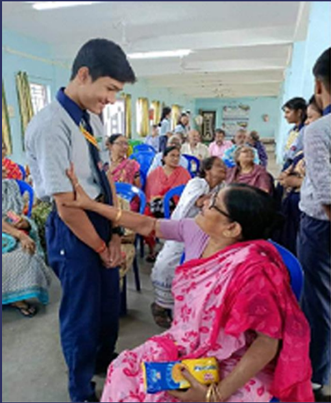
Distribution of food products by students of class IX