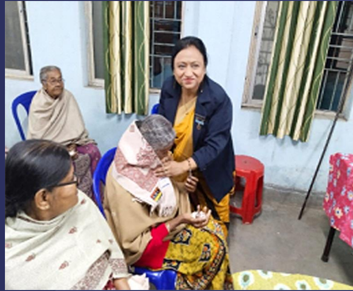
Serving thanksgiving dinner to the homeless and offering winter garments