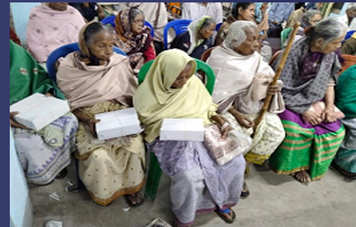
Serving thanksgiving dinner to the homeless and offering winter garments