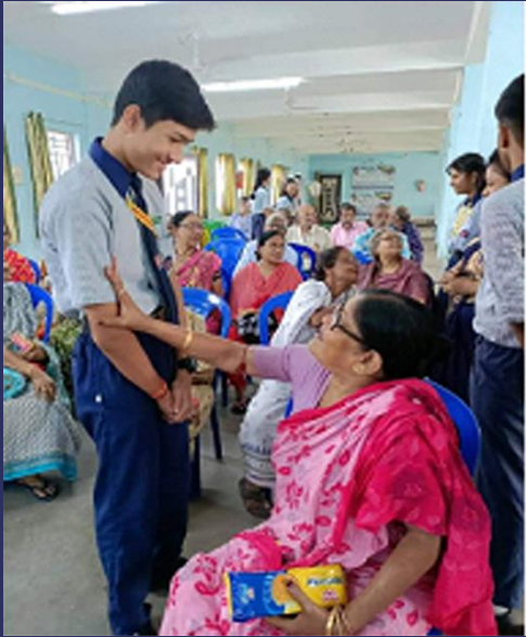
Distribution of food products by students of class IX