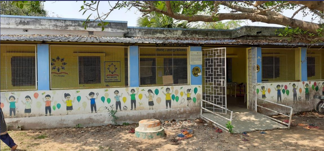
Phool Danga Primary School